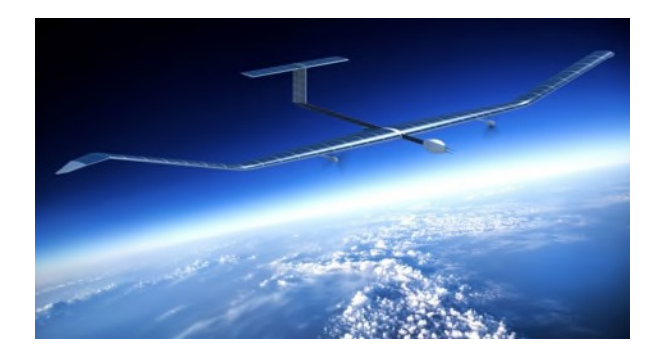
Figure 2 Airbus Zephyr Stratospheric Drone

and weighs 60 kg. It can be launched by 5 people on a standard aircraft runway and takes 8 hours to climb to its flying altitude of 20-25km. It lands back on its launch rails. Licensing and regulation in Australia is authorized by CASA. Power comes from a 3kW solar array that powers the avionics, payload and propeller engines. It has 35W of power available at night and 15W during the day<sup>7</sup>.